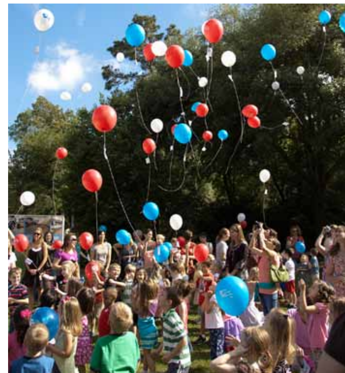
Children released balloons, containing their prayers, as part of the National Day of Prayer celebration.