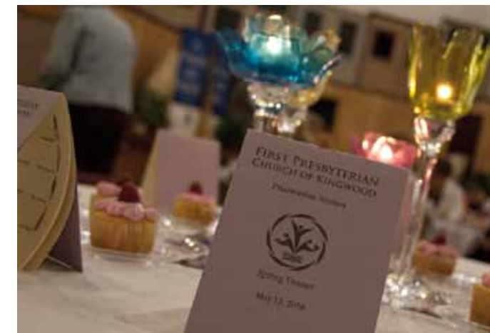
The PW Spring Dinner on May 13th was quite a success.