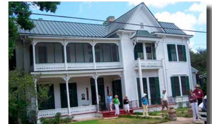
The Wells Home