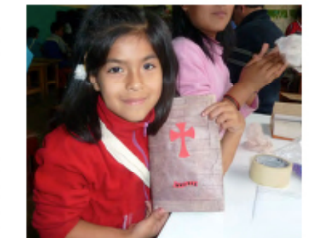
Peru Mission Newsletter

In December, 2010, the Youth voted to share $1,000 from their Living Waters funds to buy bibles for Peru. During our 2011 VBS in the 9 th of September, youth bibles were handed out in Bible Class, while the craft project that day made Bible covers from construction paper, masking tape, and shoe polish.