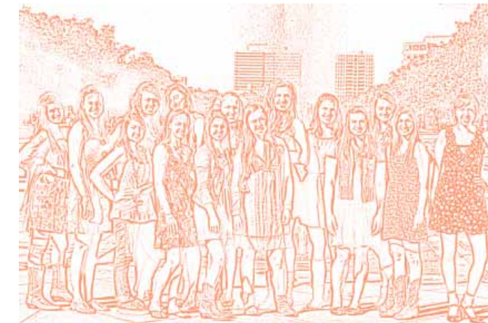
The Ladies of Team Octane