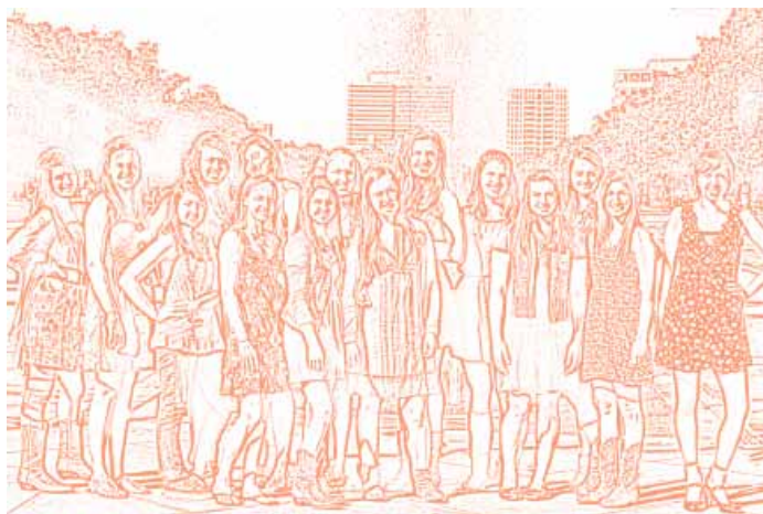
The Ladies of Team Octane