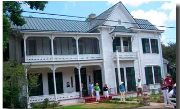
The Wells Home