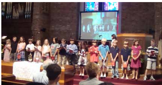
3rd Graders with their new Bibles